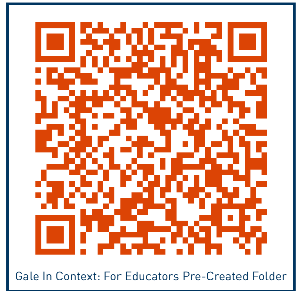
Gale In Context: For Educators Pre-Created Folder